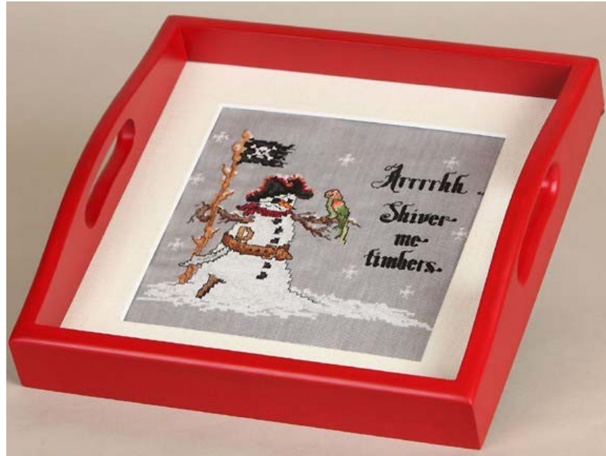
Sudberry Red Tray #68006